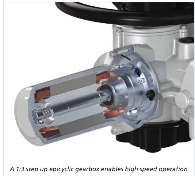
A 1:3 step up epicyclic gearbox enables high speed operation

IQH actuators have been developed for diverter valves in meter prover applications that require fast operation with positive seating and zero backdriving.