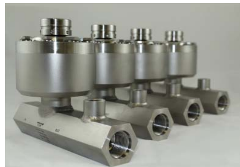
LIQUID SIZE SELECTOR CHART FOR HO SERIES SUBSEA TURBINE FLOWMETERS

Our flowmeter expertise has enabled us to supply flowmeter solutions for BOPs, ROVs, wellhead additives, subsea production systems and a variety of other subsea flow applications. With more than 40 years in the flowmeter business, we continue to set the standards for accuracy, reliability, durability, economy and integrity. In fact, no other company offers you more flow measurement solutions for subsea flow applications than we do. Put us to the test, and find out how Hoffer turbine flowmeters can resolve your challenging subsea flow applications.