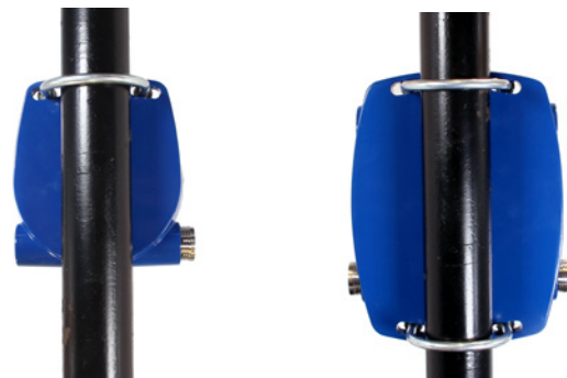
Figure 1: Rear Views of PDA6846 (left) and PDA6848 (right) (both mounted on 1.5" pipe)