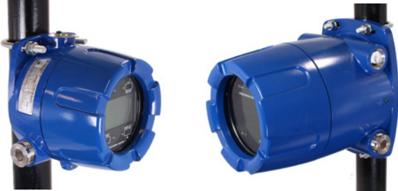
PDA6846 U-Bolt Kit (1 U-Bolt)