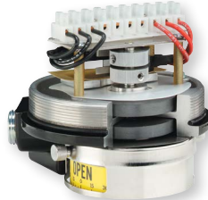
Mark 1 Magnetic Coupling Cutaway Model 12VDOJ2