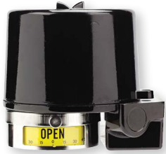
Mark 1 Polyester Coated Aluminum (Environmentally sealed for corrosive areas)