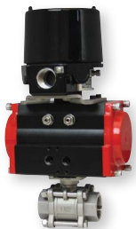
Mark Series mounted to an actuator

Mounting kits with drive yoke (see drawing), or slotted lever arm, bracket, fasteners and other zinc plated or stainless steel hardware fit over 2000 popular valves and actuators. A high strength spring tempered stainless steel drive yoke/coupling is tailored to fit securely to a specific valve or actuator stem. There is no slippage or binding. No special alignment fixtures are required due to switch offset design and yoke to stem engagement that makes installation a "snap". Each kit is specially designed for a particular valve or actuator, making field mounting simple with standard tools. Please specify make and model of valve or actuator on order.