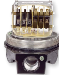
Mark 3 Multi Turn