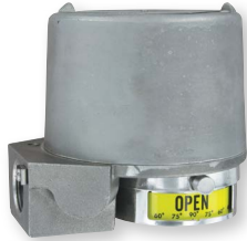
Mark 1 Stainless Steel (Environmentally sealed for corrosive areas)