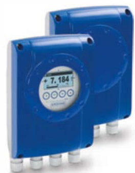
IFC 050 Display version / Blind version

The IFC 050 fulfills all industry specific requirements. Its electronics are protected against condensate with an extra coating, so it can even be used in tropical areas. The housing is protected with dual-layer painting, keeping it safe from aggressive fluids such as salt water. And of course it is very sturdy for outdoor use thanks to its shock resistance!